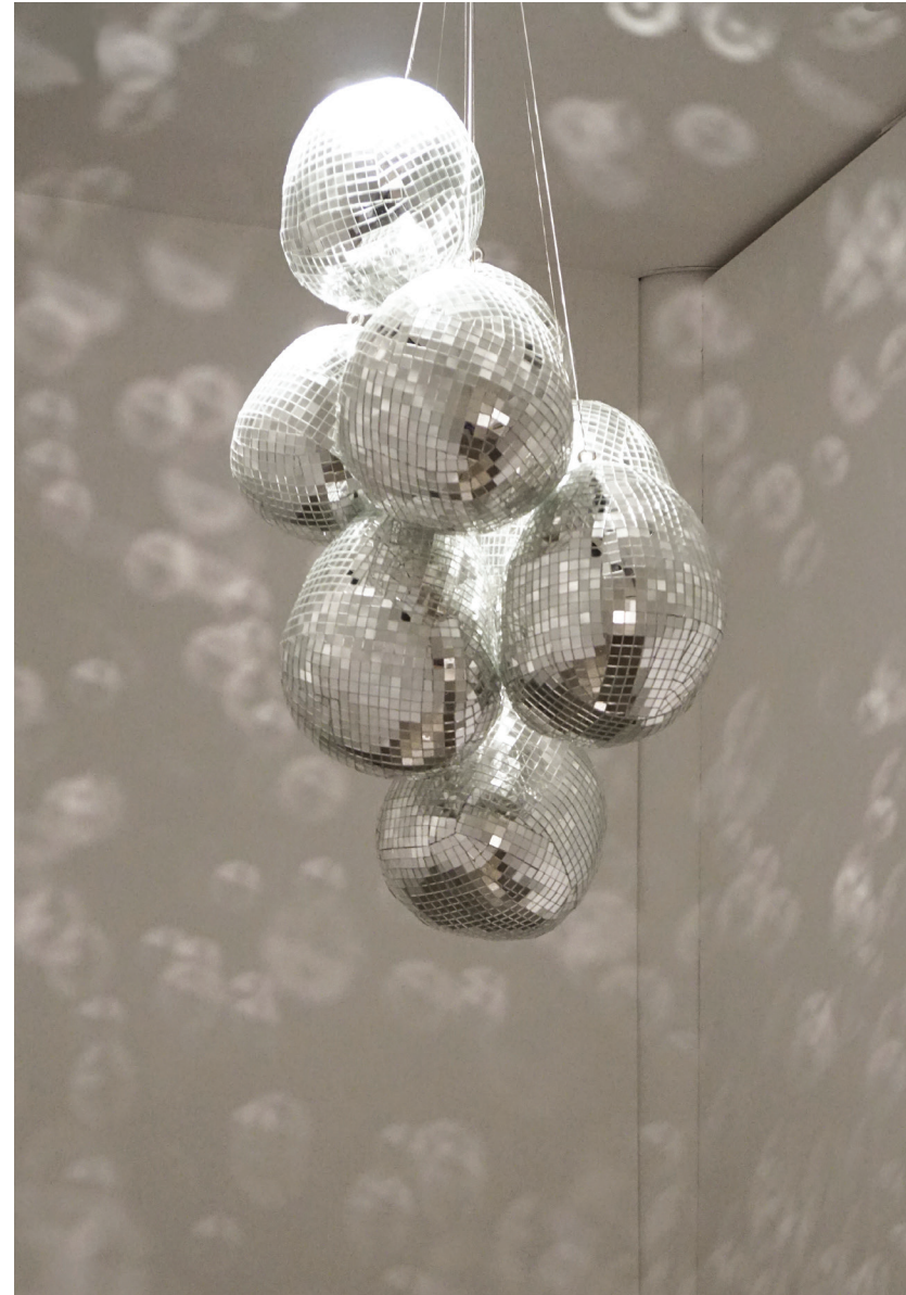
Endless Night (disco lumps) , 2017 Mirror, Styrofoam, cable, disco ball motor, beanbag chair Dimensions variable