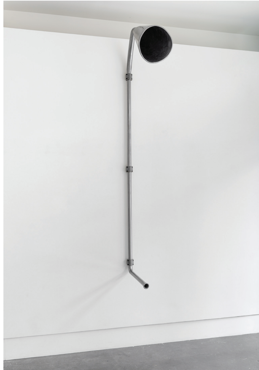
Crotch Pipe , 2019 Welded steel 90 x 15 x 24 in

Previous page Barely There , 2017 Fiberglass, FGR 9 x 8 x 3 ft