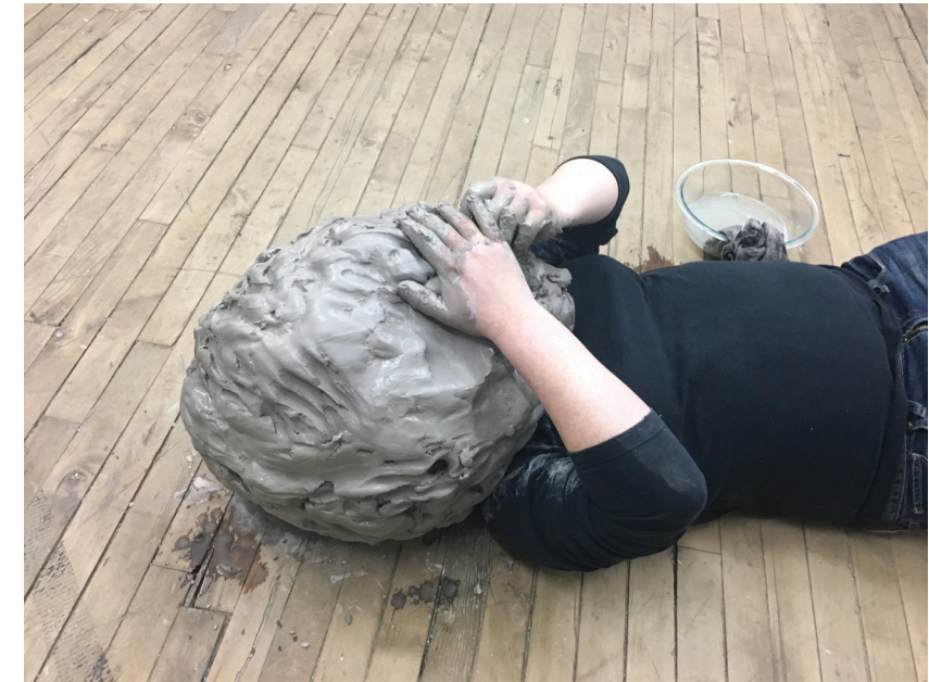
Mud Breathes Better , 2017 Clay, body, water, rag Dimensions variable