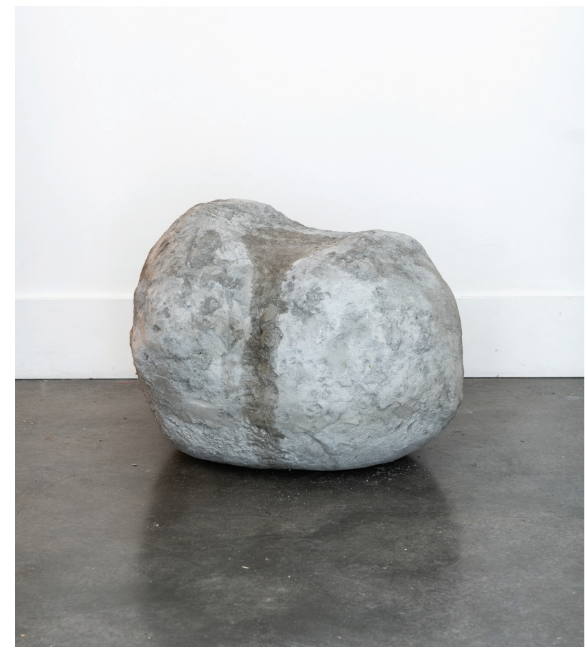
Boulder , 2019 Cement, concrete sealer 24 x 16 x 19 in