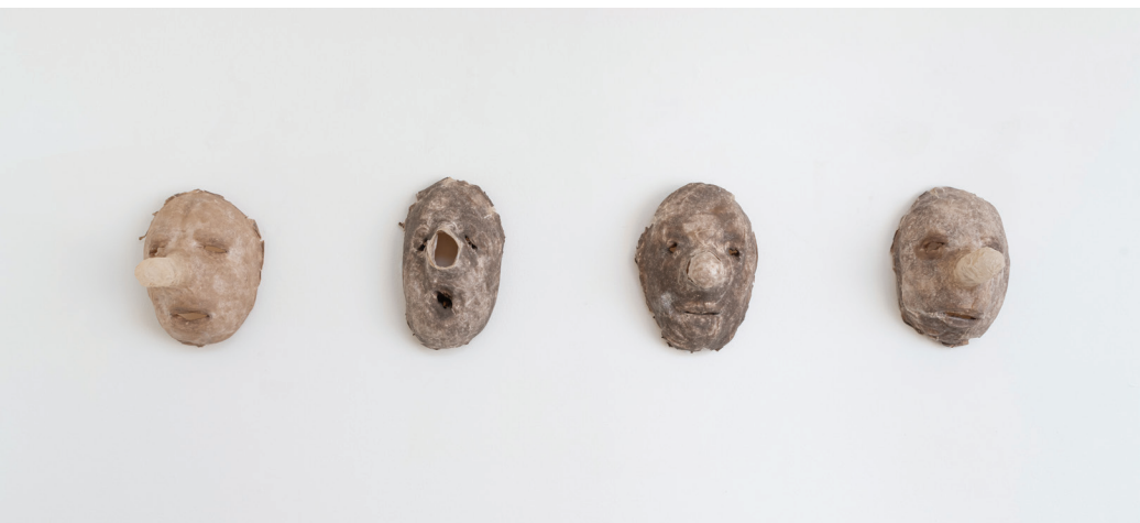
Body without body masks, 2019 Abaca pulp 8 x 8 in (each)