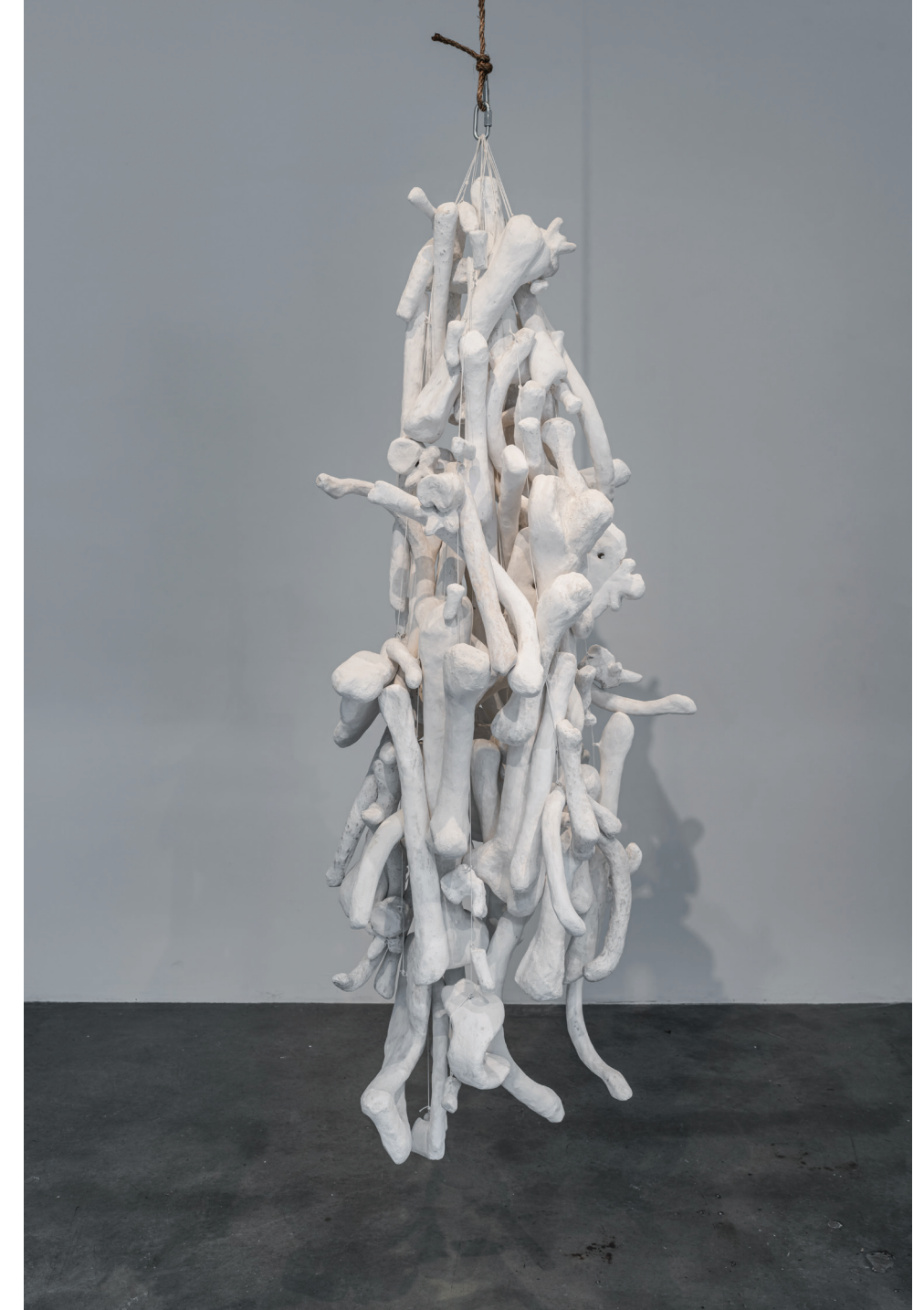
Bones, 2019 Plaster 2½ x 2 x 6 ft